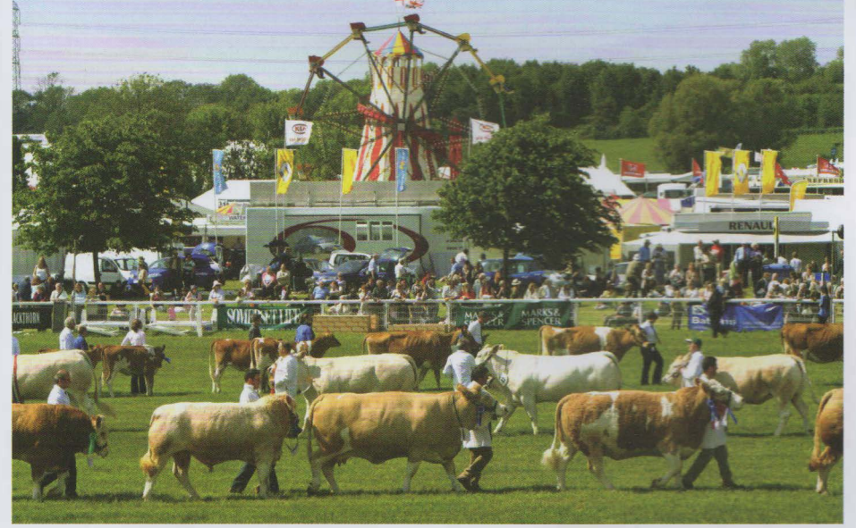
Royal Bath and West Show

www.mendip.gov.uk/business www.intosomerset.co.uk