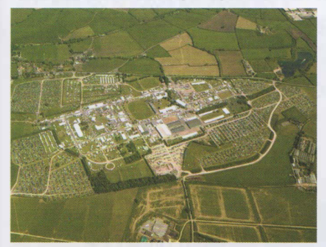
Bath & West aerial view

The Bath & West LDO provides a simplified planning offer for new development within B1 (offices, light industrial and research and development), B2 (general industrial) and B8 (storage and distribution) use classes. Units with a floor area of up to 25,000 sq metres, with a maximum height of 10m and two storeys will be exempt from normal planning fees and Section 106 planning obligations.